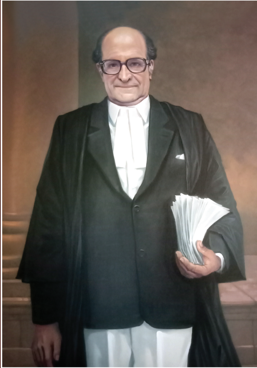
(16th January 1920 - 16th January 2020) Birth Centenary of the Legendary Mr. Nani A. Palkhivala Celebrated...